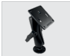
Ball joint mount