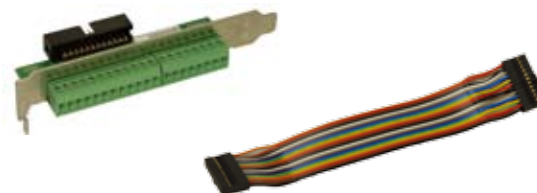
IVC-100G-RS-R20 GPIO-daughter board and cable